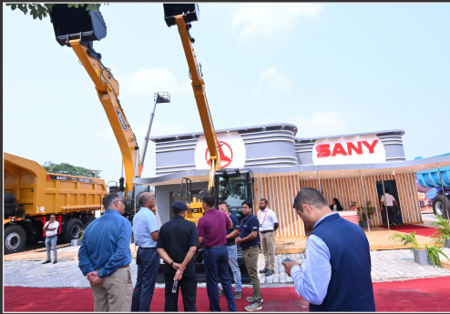
PHOTO GALLERY - IMME 2024